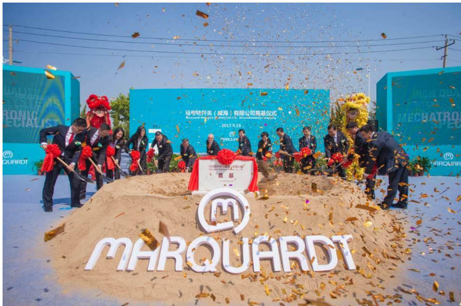
Marquardt_Press_Business_Year_2017_Weihai_3.jpg: A key strategic step in Asia: Marquardt is building its second Chinese production plant in Weihai.