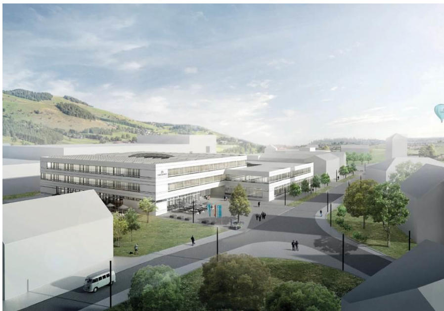
Marquardt_Press_Business_Year_2017_EIZ_4.jpg: Marquardt is building a development and innovation center at its German headquarters in Rietheim-Weilheim, costing over €30 million.