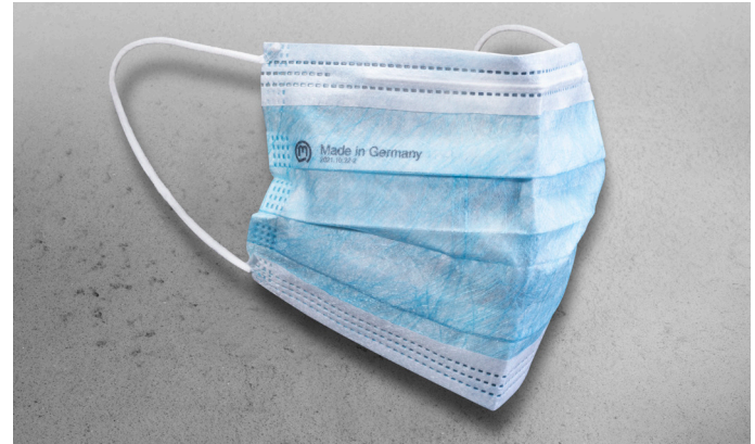
Product number 7112.5001