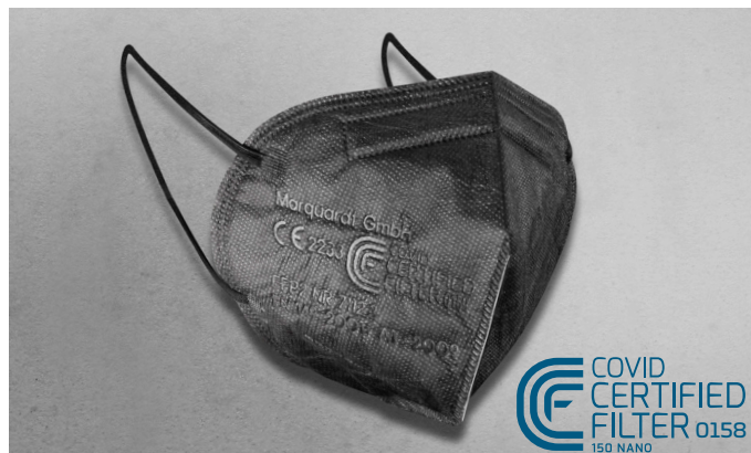
Product number 7112.3001