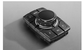
CENTRAL CONTROL UNIT Series 3583