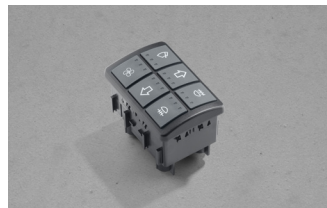
INTELLI MODULE KEYPAD Series 3362