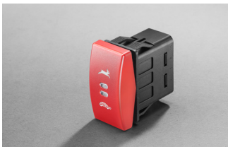
LIN-BUS ROCKER SWITCH Series 3270