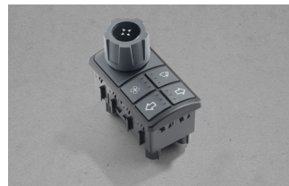
JOG MODULE Series 3362